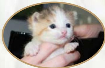
And Little Orphan Pansy!