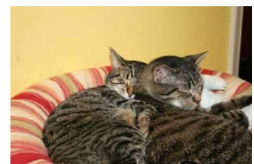
Belez & Star Sweet and comfortable