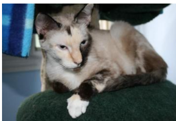
Cherokee Siamese mix

The Chesapeake Cats & Dogs Center is located in Chester across from Western Auto in the Island Professional Park. The hours are: Sunday 10 – 2, Monday through Friday 11 – 3 and Saturday 10 – 4. Stop in to play with the cats. A few are pictured here. The Center is a fun, colorful place to visit. It is a warm, safe haven for some of our cats who have been abandoned.