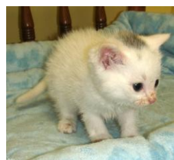
Lizzie Fiesty cuddlebug