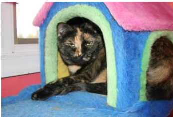
Alice – Gentle torti

The Chesapeake Cats & Dogs Center is located in Chester across from Western Auto in the Island Professional Park. The hours are: Sunday 10 – 2, Monday through Friday 11 – 3 and Saturday 10 – 4. Stop in to play with the cats. A few are pictured here. The Center is a fun, colorful place to visit. It is a warm, safe haven for some of our cats who have been abandoned.