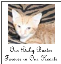
Our Baby Buster Forever in Our Hearts