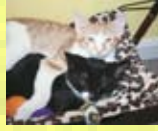
Sunny & Cloudy