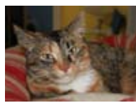
Picasso and Zoe